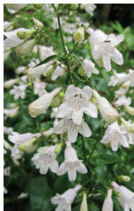
Smooth Beardtongue Penstemon digitalis