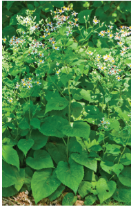
Big-Leaved Aster Aster macrophyllus