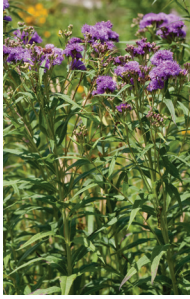
Common Ironweed Vernonia fasciculata