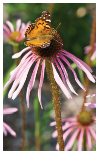
Pale Purple Coneflower Echinacea pallida