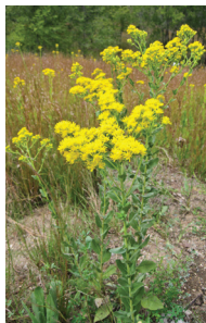
Stiff Goldenrod Solidago rigida