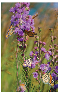
Meadow Blazingstar Liatris ligulistylis