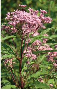
Spotted Joe Pye Weed Eupatorium maculatum