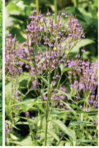
Blue Vervain Verbena hastata