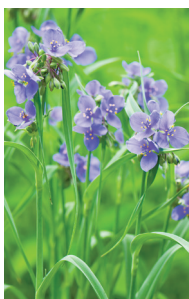
Prairie Spiderwort Tradescantia bracteata