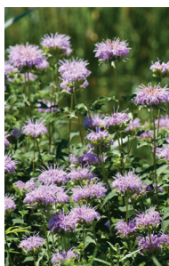
Wild Bergamot Monarda fistulosa