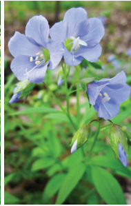
Jacob's Ladder Polemonium reptans