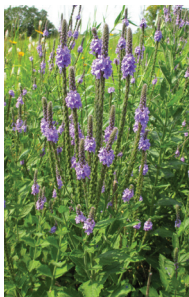
Hoary Vervain Verbena stricta