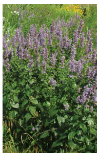
Anise Hyssop Agastache foeniculum