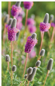
Purple Prairie Clover Dalea purpurea