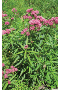
Swamp Milkweed Asclepias incarnata