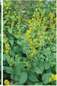
Zigzag Goldenrod Solidago flexicaulis