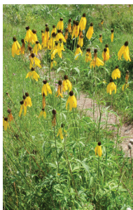
Yellow Coneflower Ratibida pinnata