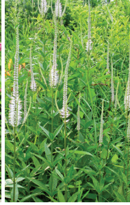
Culver's Root Veronicastrum virginicum