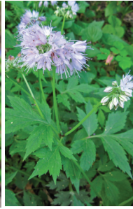
Virginia Waterleaf Hydrophyllum virginianum