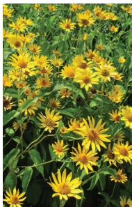
False Sunflower Heliopsis helianthoides