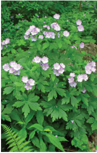
Wild Geranium Geranium maculatum