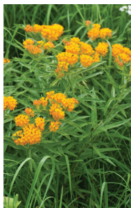
Butterfly Milkweed Asclepias tuberosa