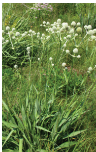
Rattlesnake Master Eryngium yuccifolium